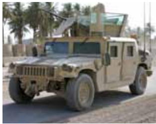
Vehicle Armor Energy Absorption