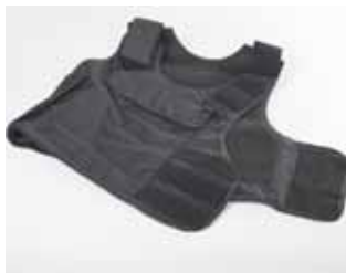
Body Armor Energy Absorption