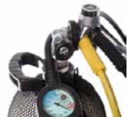
Impermeable Pressure Vessels