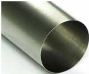
Nanovate™ Liner ready for your overwrapping