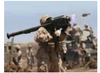
Durable Launch Tubes