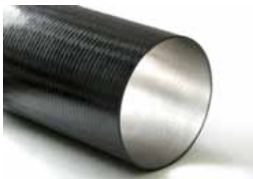
Finished Nanovate™ Lined Tube