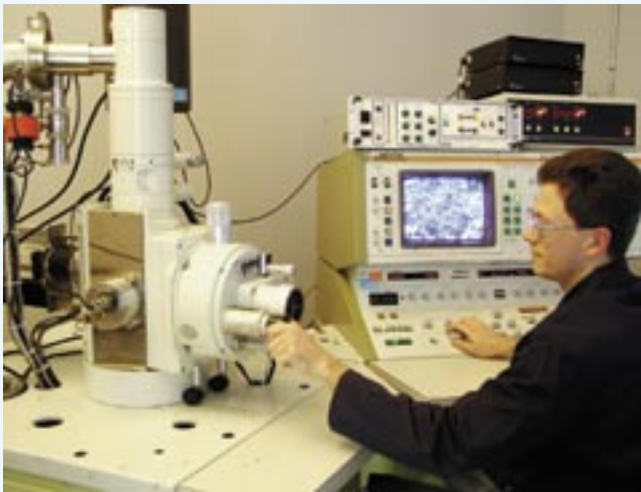
Integran is a pioneer in developing and characterizing nanomaterials.

Why the interest in grain boundaries? Basically it is the disorder there. Crystalline materials have a regular array of atoms, which allow materials to be bent and/or stretched , which is fine where ductility and formability are needed. In between the crystals are narrow (usually less than 1 nm) regions, which are disordered. These disordered regions frequently compromise the durability and longevity of structural components through processes like intergranular corrosion, cracking, creep, etc. Integran's top-down GBE process controls the degree of disorder in these regions. Using this top-down process, such important facets as fatigue and creep resistance as well as stress corrosion cracking resistance are enhanced far beyond what traditional metallurgical processing can accomplish.